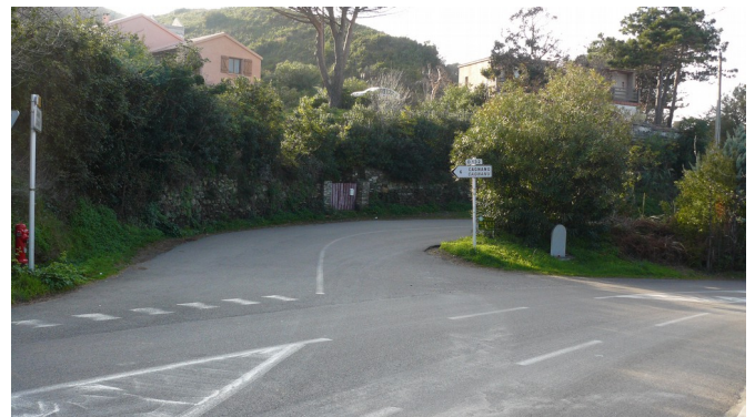
Illustration 1: Turn-off after Porticciolo for CAGNANO