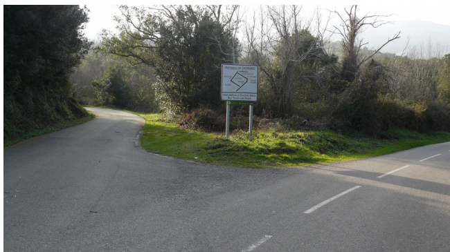
Illustration 2: Fork in the road for SUARE