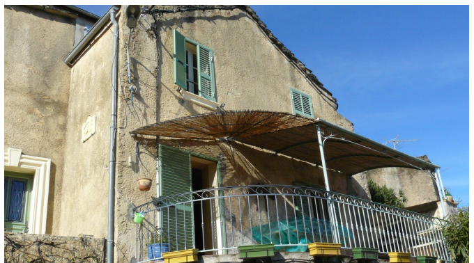
Illustration 3: Front of the house